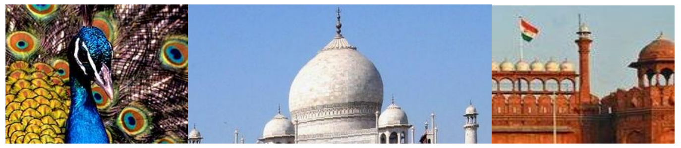
A NEXT GENERATION REGIONAL TURBOPROP TRANSPORT: A NATIONAL AEROSPACE PROJECT FOR INDIA