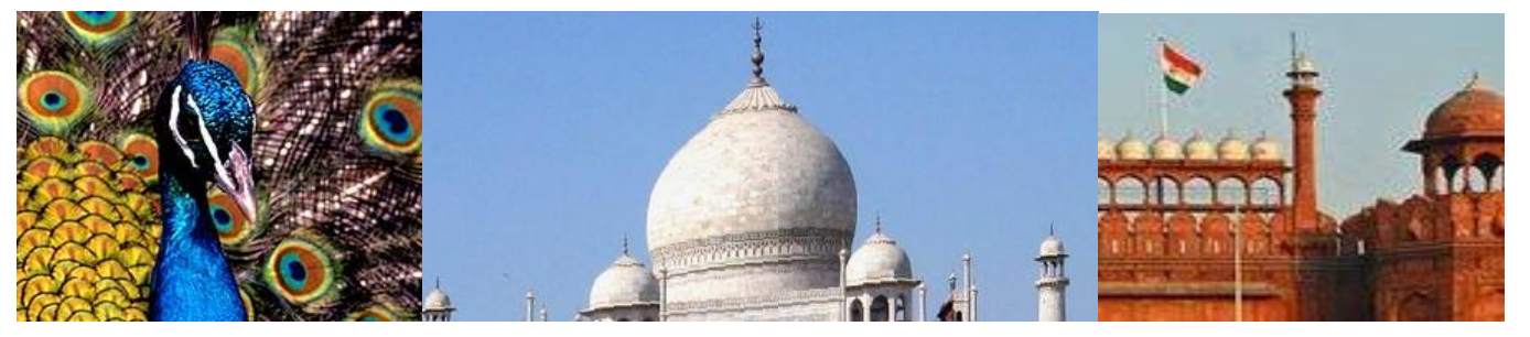
THE IMPACT OF DIRECT AND INDIRECT TAXES ON FOREIGN CARRIERS OPERATING IN INDIA